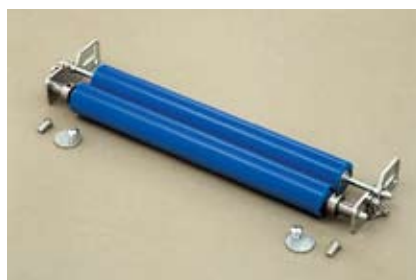
Pop-Out Roller 3195