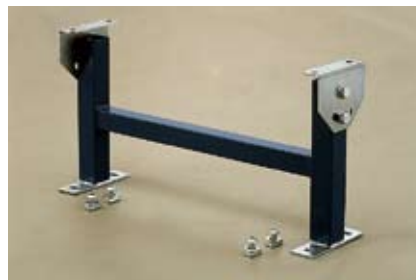
H-Type Support F3002